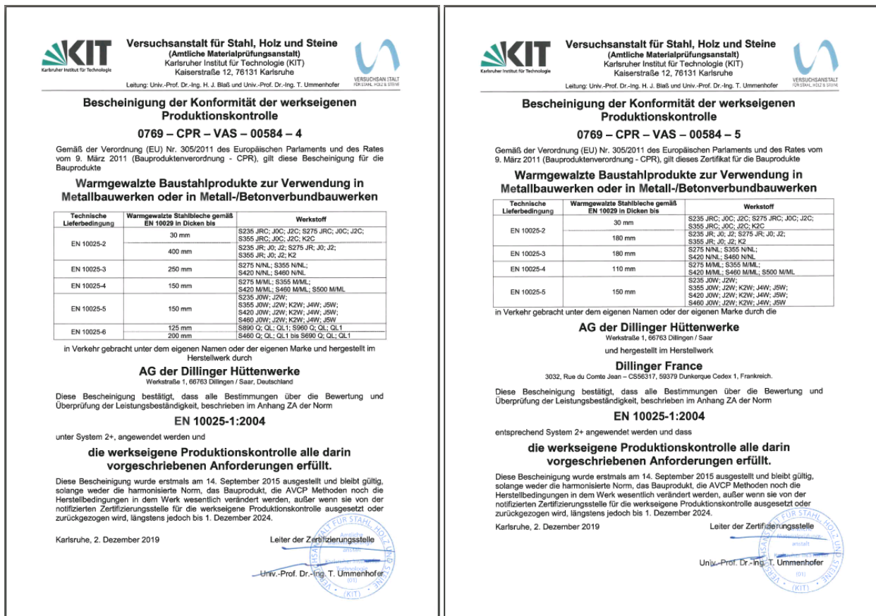
Figure 2: CE certificates Dillinger and Dillinger France for the steel grades of the new EN 10025

For Dillinger France: https://www.dillinger.de/d/downloads/download/8130