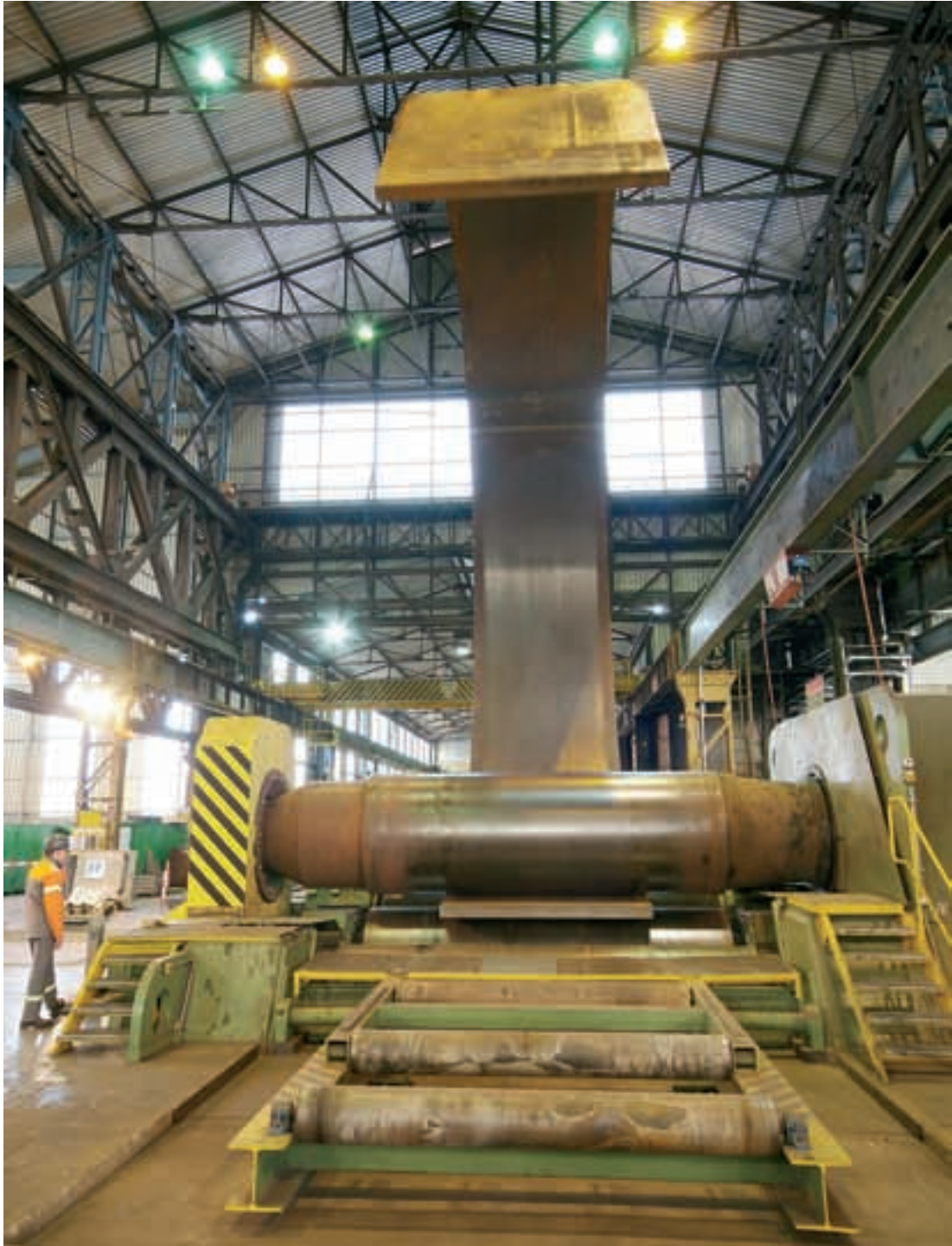
Cold forming process by means of the 4-roll bending machine (8.600 t force) of a cylindrical shell-course in steel grade 20 MnMoNi 4-5 to VD TÜV 440-1100 designed for a petrochemical reactor